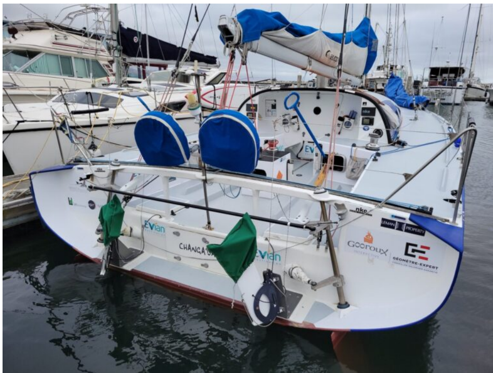
Changabang shows off her stern-style.