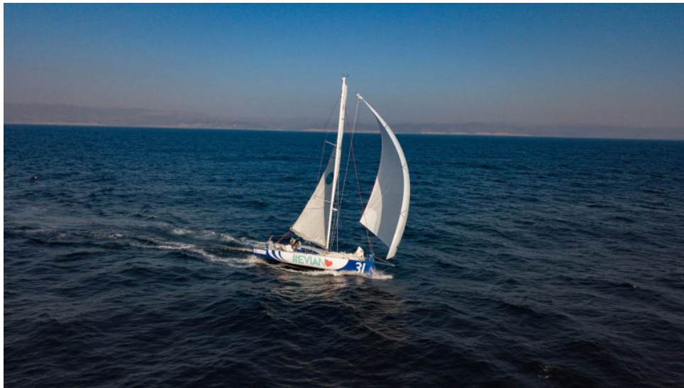
The Class 40 Changabang looks like she handles herself well on an ocean crossing.